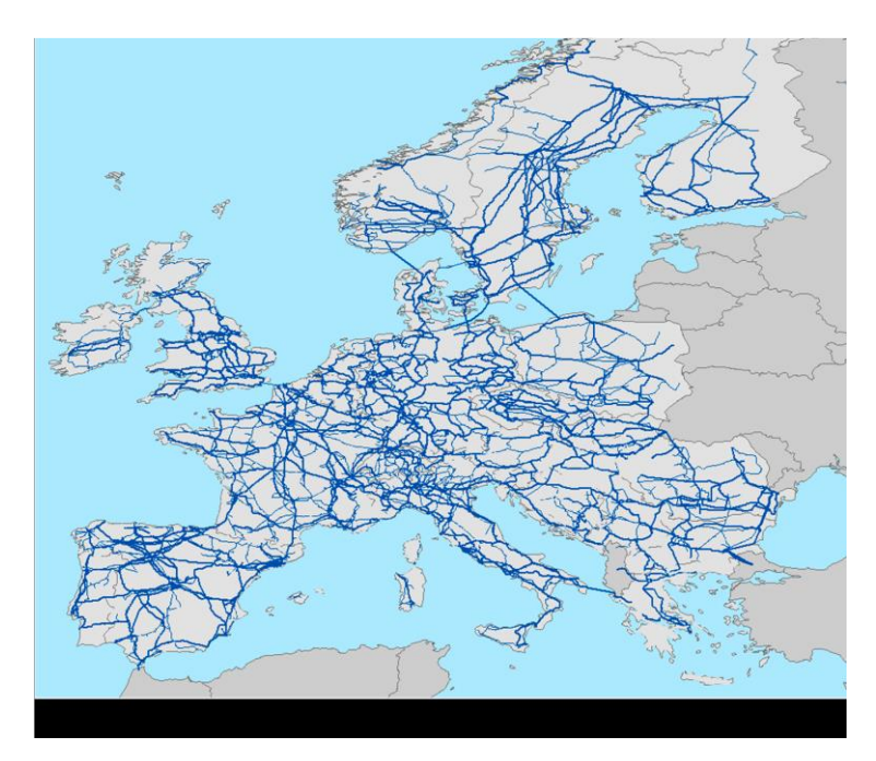
Figure 1. Schematic representation of the transmission grid (220-999 kV) in the European Union. The image highlights the intensiveness with which this area is interconnected through transmission lines

"Normally, these supports are placed at a distance of about 200-400 metres from each other and with a base of 10 by 10 m (100 m2) on average. Today, Europe has a transmission grid of about 500,000 km of overhead lines and the United States about 254,000 km, which means 2.5 million and 1.27 million supports, respectively. Consequently, we have a large area under the towers that we can potentially use to connect populations of species with limited dispersal capacity in fragmented landscapes," concludes Miguel Ferrer.